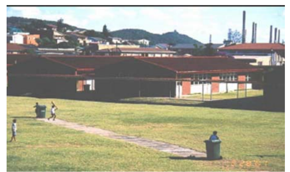
Figure 4 Settler Primary School (front) with Engen refinery stacks (back) (see online version for colours)

This study was conducted at the Settlers Primary School situated in the Merebank community of the SDIB. This school was selected because of the anecdotal reports of high prevalence of asthma, repeated mass visits to health services and the presence of a dedicated monitoring station on the grounds of the school. The school is approximately 0.5 km from the one of the refineries, and approximately 1 km from the second (Figure 4).