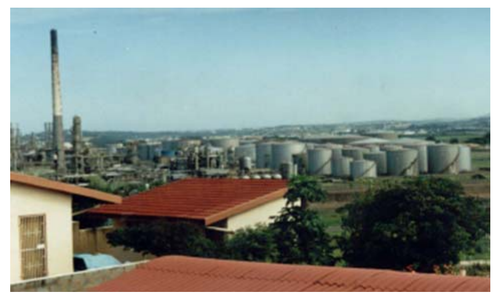
Figure 2 Engen refinery (middle) with community residences of Wentworth (back) and Merebank (front) (see online version for colours)

Figure 1 Sapref oil refinery (back) with community residences in Merebank (front) (see online version for colours)