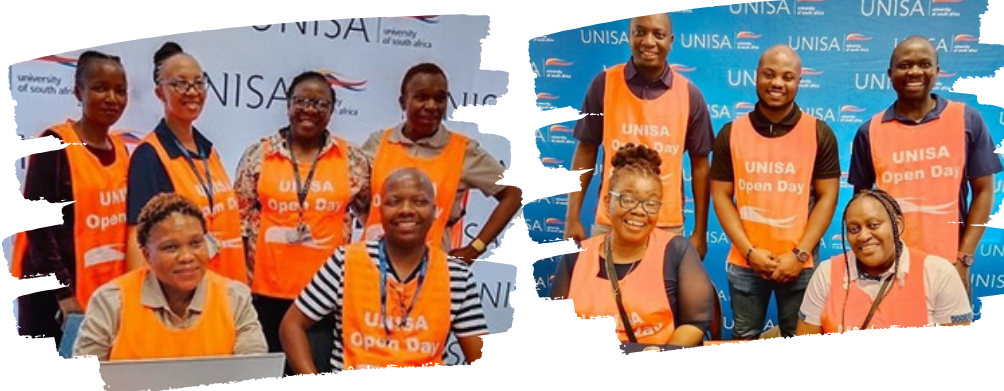
Team Gauteng and Team DIA ready to wow the students with service excellence