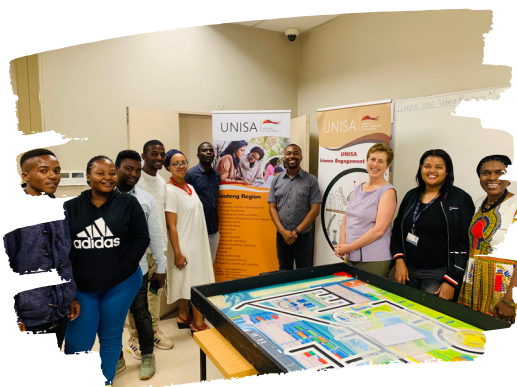
Participants at the Sunnyside Campus