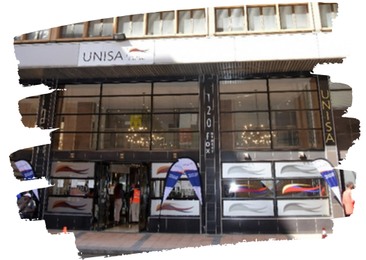
The new Johannesburg RSC home, Indoni House, 120 Fox Street, Johannesburg CBD

Gauteng Open Day held at it's new home in Johannesburg. Each year, the University hosts a series of open days at its regional centres across the country, to support potential and current students in making informed decisions about their studies. Gauteng Open Day was held at the JHB Regional Services Centre on 9 & 10 September 2022. The event was a golden opportunity to showcase these new premises to our stakeholders.