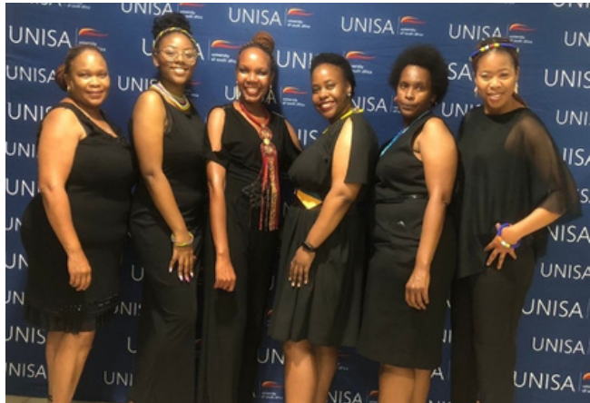
The A-TEAM that put all the puzzle pieces together into a success story