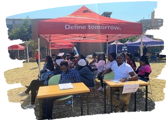
Sunnyside Wellness Day