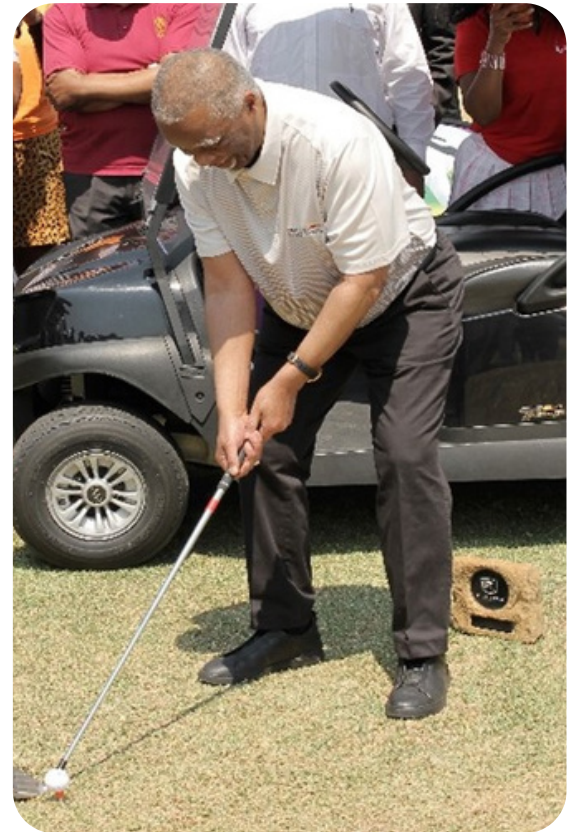
The Chancellor's ceremonial tee off