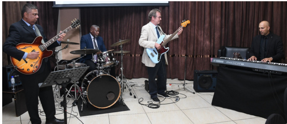
Unisa jazz band kept the audience entertained