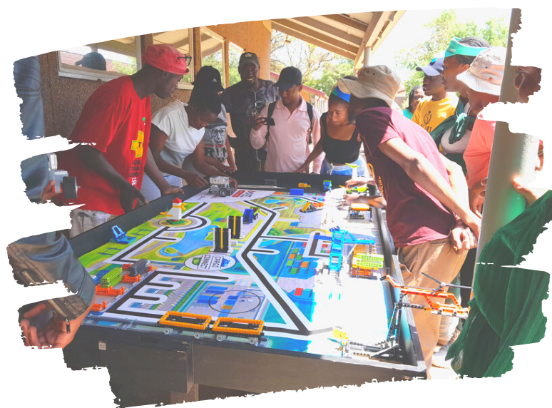
Participants at Ekurhuleni Campus