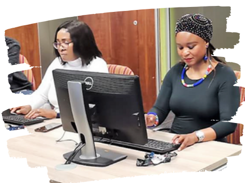
Staff members from Florida coding Robots