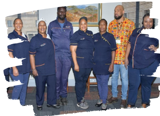
This team is behind the squeaky-clean building