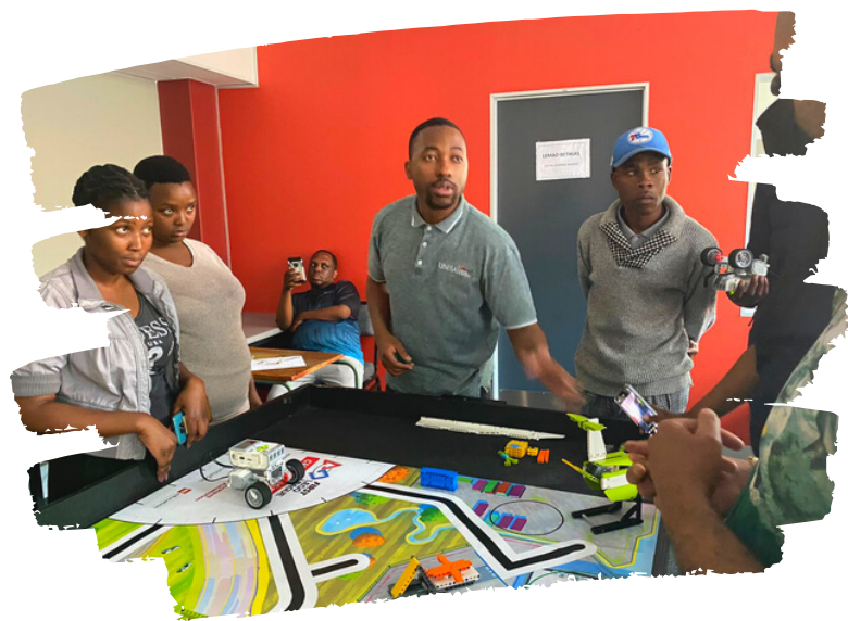
Participants at Johannesburg Campus