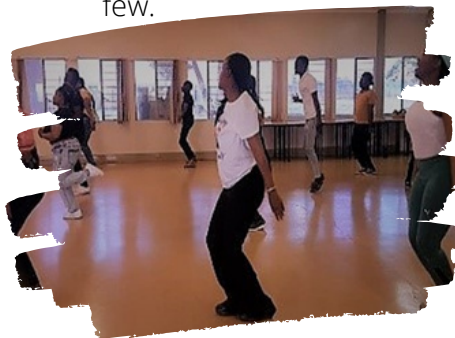
Aerobics session in Ekurhuleni