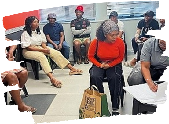
Johannesburg – students consulting with a health professional

On 6 October 2022, a virtual Substance Abuse Awareness Day was organised by Johannesburg RSC in collaboration with Higher Health, Tranquillity Rehabilitation Centre and Student Affairs. They raised awareness about substance abuse, its effects on people's lives and how to fight addiction.