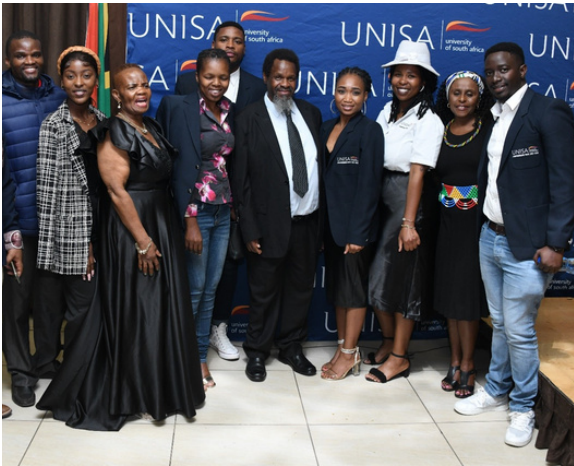
The student leadership represented the student community well