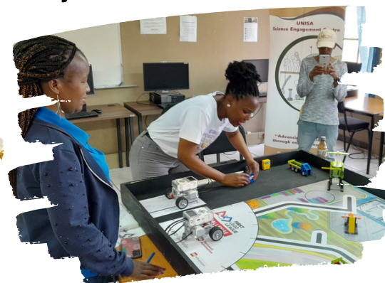
Vaal Staff members during the Robotics session