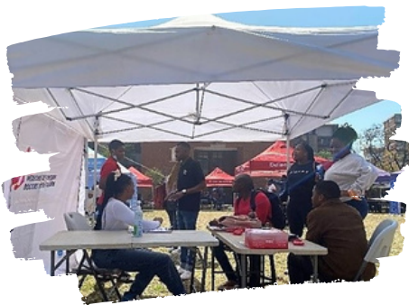
Staff and students visiting health stalls in Sunnyside

The Counselling Unit hosted Wellness Day Campaigns in Sunnyside, Ekurhuleni and Johannesburg centres aimed at the health and wellness of students and empowering them to know their health status. Free HIV testing and health screenings for students and staff were provided with referrals where needed. Various health specialists were in attendance, such as an optometrist, physiotherapist, dietician, audiologist, and foot specialist to name a few.