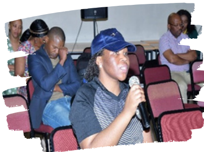
Question and Answer session