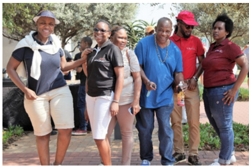
Team Gauteng ready to serve