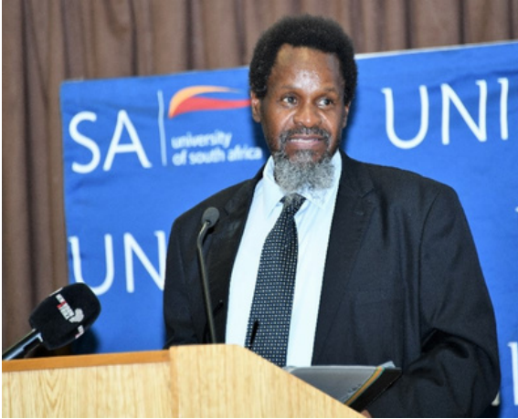
Honourable Judge Tshifhiwa Maumela delivers keynote address

A beautiful tale of a young partnership; told even better in pictures.