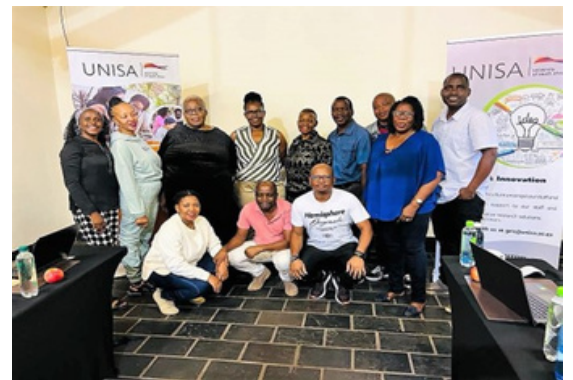
Gauteng Region staff with the workshop facilitators