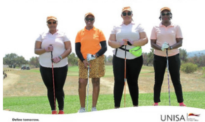
Unisa Chancellor's Stakeholder Engagement Golf Day 2022